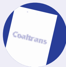
Delegate Messaging App Sponsor