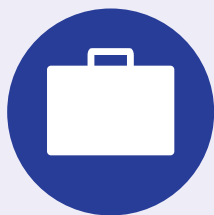
Delegate Bag sponsor